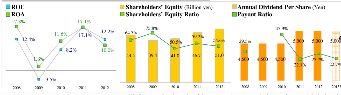
*If adjusted to reflect the number of shares prior to the stock split, the forecast of the annual dividend per share would be equivalent to 5000.00 yen (2nd quarter end: 2,500.00 yen; fiscal year end: 2,500.00 yen).

2. The company conducted a 100-for-1 stock split on October 1, 2012.