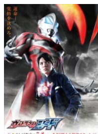
“ULTRAMAN GEED”

The Ultraman Series marks its 50 years in 2016. To mark the milestone for the series that features a hero loved by three generations in Japan, cross-media action will be organized in collaboration with business partners in Japan and overseas.