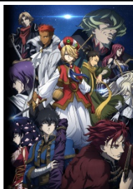
“Altair: A Record of Battles”

Global development and cross-media development under way for visual productions, in cooperation with major companies in the entertainment industry and SVOD (Subscription Video On Demand) businesses in Japan and overseas.