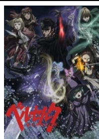
“BERSERK”

“BERSERK” (written by Kentaro Miura, featured in “YOUNG ANIMAL” magazine from HAKUSENSHA CO., Ltd.) is a dark fantasy comic series that started publication in 1989 and has sold a cumulative total of 40 million copies worldwide. A trilogy movie has been distributed since 2012, along with cross-media development into game and pachinko/pachislot versions.