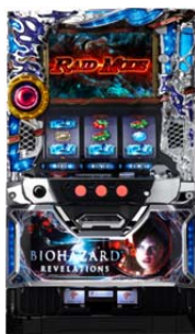
“Resident Evil Revelations” © CAPCOM CO., LTD. ALL RIGHTS RESERVED.

During the period for this medium-term management plan, the Group will promote improvements to productivity by enhancement of distribution base, expansion of products handled, building of business structure that will not be upset by changes in market environment, and supplying of PS solutions. In addition, by strengthening relations as a distributor and trading company, the Group aims to have a stable provision of products throughout the year.