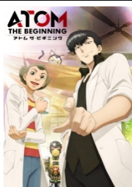
“ATOM THE BEGINNING”

“ATOM THE BEGINNING” is based on the character Ambassador Atom who appeared in “Ambassador Atom,” serialized in the comic magazine “Shōnen” in 1951, and its spin-off “Astro Boy.” This is a reboot work that talks about the events up to the birth of Astro Boy, and serialization in the comic magazine “HERO’S Monthly” started in April 2015.