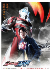
“ULTRAMAN GEED”

The Ultraman Series marks its 50 years in 2016. To mark the milestone for the series that features a hero loved by three generations in Japan, cross-media action will be organized in collaboration with business partners in Japan and overseas.