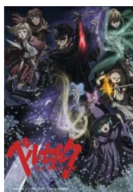
BERSERK ©KENTAROU MIURA(STUDIO GAGA) HAKUSENSHA/BERSERK PARTNERSHIP

BERSERK (written by Kentarou Miura, featured in YOUNG ANIMAL magazine from HAKUSENSHA CO., Ltd.) is a dark fantasy comic series that started publication in 1989 and has sold a cumulative total of 40 million copies worldwide. A trilogy movie has been distributed since 2012, along with cross-media development into game and PS versions.