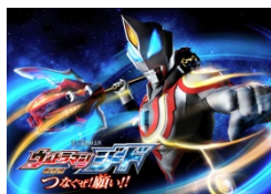
ULTRAMAN GEED THE MOVIE

The Ultraman Series marked its 50 years in 2016. To mark the milestone for the series that features a hero loved by three generations in Japan, cross-media action will be organized in collaboration with business partners in Japan and overseas.