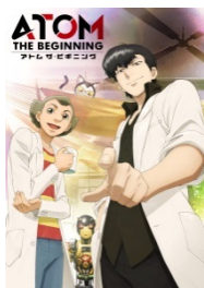
ATOM THE BEGINNING

ATOM THE BEGINNING is based on the character Ambassador Atom who appeared in Ambassador Atom , serialized in the comic magazine Shōnen in 1951, and its spin-off Astro Boy . This is a reboot work that talks about the events up to the birth of Astro Boy , and serialization in the comic magazine HERO'S Monthly started in April 2015.