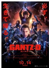
GANTZ:O

GANTZ (written by Hiroya Oku, SHUEISHA Inc.) is a SF action series that started publication in 2000 in the WEEKLY YOUNG JUMP and has sold a cumulative total of more than 21 million copies. The work has been developed into live action movie and game etc. and won the support of fans in Japan and overseas. FIELDS CORPORATION Group plans cross-media development spurred on by production of the movie version.