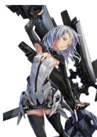
BEATLESS

Global development and cross-media development under way for visual productions, in cooperation with major companies in the entertainment industry and SVOD (Subscription Video On Demand) businesses in Japan and overseas.