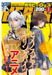
HERO'S Monthly

The Group has continued focusing on creating heroes IP assets chiefly through HERO'S Monthly . It has also stepped up efforts to diversify distribution methods and establish new partnerships in Japan and overseas in the e-book platform.