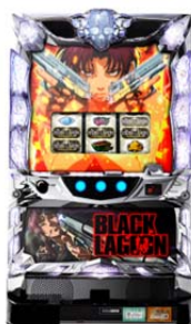
PACHISLOT BLACK LAGOON3 ©2006, 2010 広江礼威・小学館/BLACK LAGOON 製作委員会 ©NANASHOW

During the period for this medium-term management plan, the Group will promote improvements to productivity by enhancement of distribution base, expansion of products handled, building of business structure that will not be upset by changes in market environment, and supplying of PS solutions. In addition, by strengthening relations as a distributor and trading company, the Group aims to have a stable provision of products throughout the year.