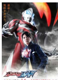
“ULTRAMAN GEED”

The Ultraman Series marks its 50 years in 2016. To mark the milestone for the series that features a hero loved by three generations in Japan, cross-media action will be organized in collaboration with business partners in Japan and overseas.