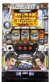
“Pachislot Machine Ace Attorney” © CAPCOM CO., LTD. ALL RIGHTS RESERVED.

During the period for this medium-term management plan, the Group will promote improvements to productivity to achieve short-term recovery of business results, building of business structure that will not be upset by changes in market environment, and supplying of PS solutions. In addition, by strengthening relations as a distributor and trading company, the Group aims to have a stable provision of products throughout the year.