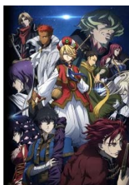
“Altair: A Record of Battles”

Global development and cross-media development under way for visual productions, in cooperation with major companies in the entertainment industry and SVOD (Subscription Video On Demand) businesses in Japan and overseas.