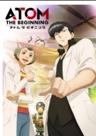
“ATOM THE BEGINNING”

“ATOM THE BEGINNING” is based on the character Ambassador Atom who appeared in “Ambassador Atom,” serialized in the comic magazine “Shōnen” in 1951, and its spin-off “Astro Boy.” This is a reboot work that talks about the events up to the birth of Astro Boy, and serialization in the comic magazine “HERO’S Monthly” started in April 2015.