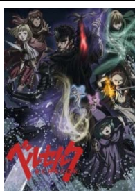
“BERSERK” ©KENTAROU MIURA(STUDIO GAGA) HAKUSENSHA/BERSERK PARTNERSHIP

“BERSERK” (written by Kentaro Miura, featured in “YOUNG ANIMAL” magazine from HAKUSENSHA CO., Ltd.) is a dark fantasy comic series that started publication in 1989 and has sold a cumulative total of 40 million copies worldwide. A trilogy movie has been distributed since 2012, along with cross-media development into game and pachinko/pachislot versions.