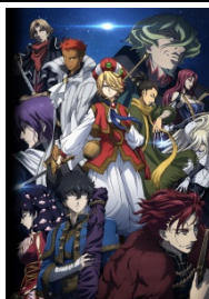
“Altair: A Record of Battles”

Global development and cross-media development under way for visual productions, in cooperation with major companies in the entertainment industry and SVOD (Subscription Video On Demand) businesses in Japan and overseas.