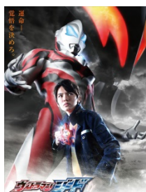
“ULTRAMAN GEED”

The Ultraman Series marks its 50 years in 2016. To mark the milestone for the series that features a hero loved by three generations in Japan, cross-media action will be organized in collaboration with business partners in Japan and overseas.