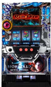
“Resident Evil Revelations” © CAPCOM CO., LTD. ALL RIGHTS RESERVED.

During the period for this medium-term management plan, the Group will promote improvements to productivity by enhancement of distribution base, expansion of products handled, building of business structure that will not be upset by changes in market environment, and supplying of PS solutions. In addition, by strengthening relations as a distributor and trading company, the Group aims to have a stable provision of products throughout the year.