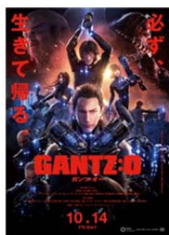
“GANTZ:O”

“GANTZ” (written by Hiroya Oku, SHUEISHA Inc.) is a SF action series that started publication in 2000 in the “WEEKLY YOUNG JUMP” and has sold a cumulative total of more than 21 million copies. The work has been developed into live action movie and game and won the support of fans in Japan and overseas.